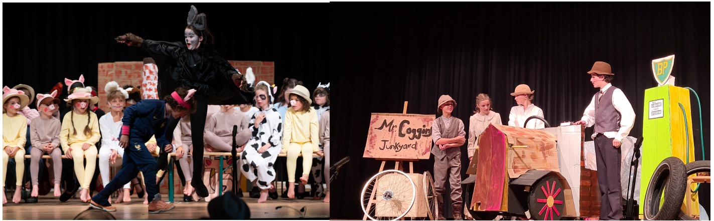
Roald Dahl's The Three Little Pigs- Primary Production June 2023 Chitty Chitty Bang Bang – Middle School production June 2023

Please note that only EU/Swiss nationals applications will be considered due to strict Swiss working permit regulations.